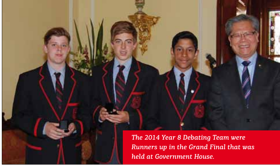
The 2014 Year 8 Debating Team were Runners up in the Grand Final that was held at Government House.