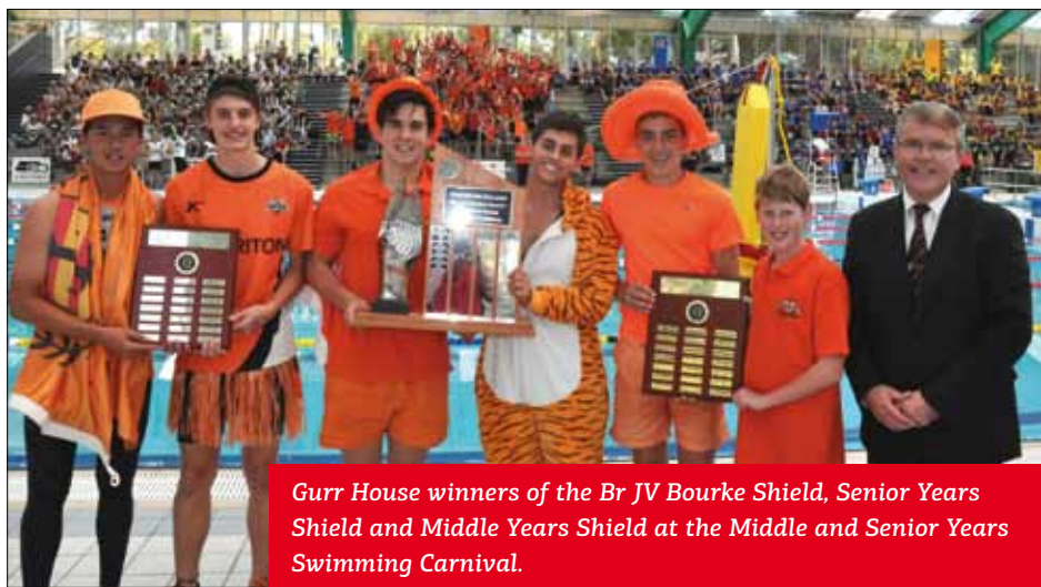
Gurr House winners of the Br JV Bourke Shield, Senior Years Shield and Middle Years Shield at the Middle and Senior Years Swimming Carnival.