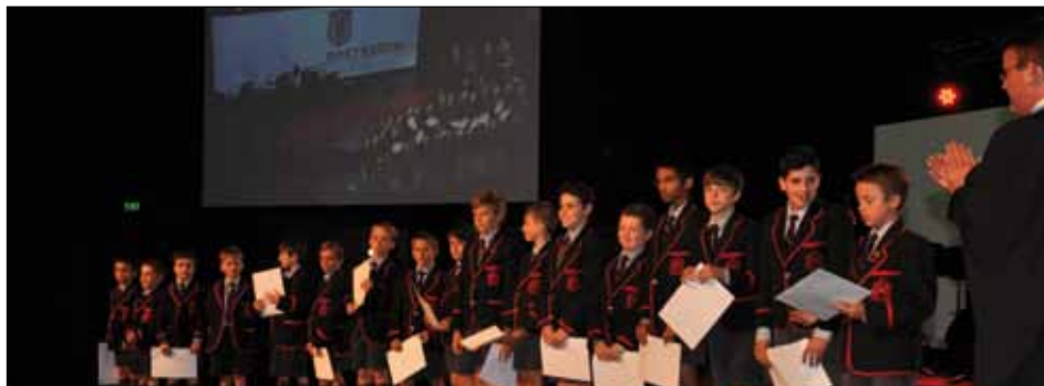
2014 saw Presentation Night revived, held at the Paradise Church, as it returned to a free compulsory event. It was a fantastic evening where we recognized the achievements of those who have excelled and witnessed the talent of our Music Department.