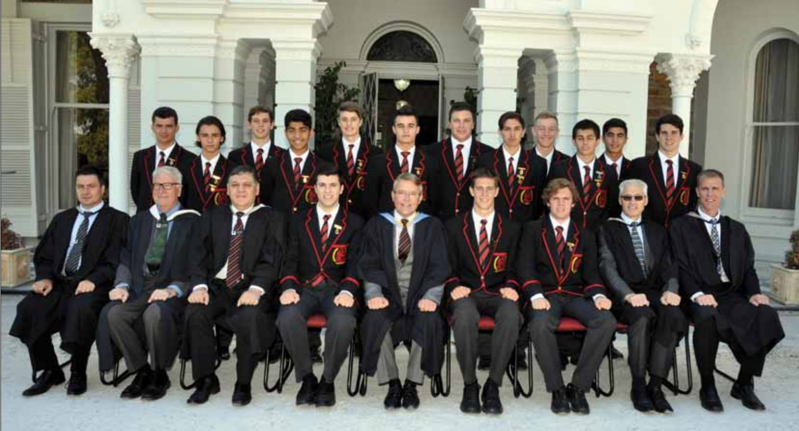
Front Cover: 2015 Opening Valley Assembly