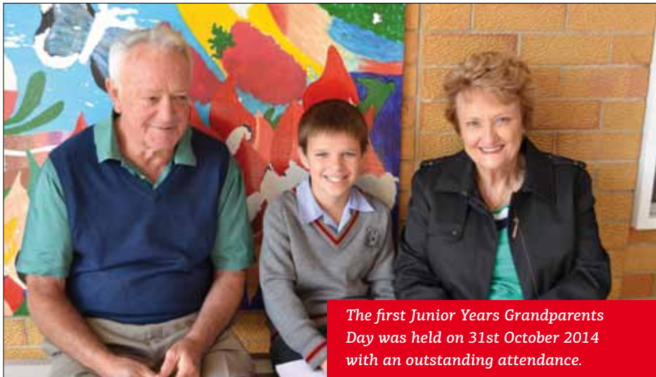
The first Junior Years Grandparents Day was held on 31st October 2014 with an outstanding attendance.