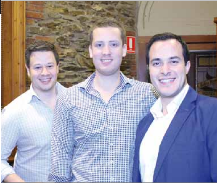
2004 30 Year Reunion - Saturday 11th October 2014, Robin Hood Hotel