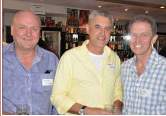
1974, 40 Year Reunion - Saturday 1st November 2014, Whitmore Hotel

Reunions will also be held for the following peer years throughout 2015. Dates still to be confirmed. 1965, 1975, 1985, 2005, 2014