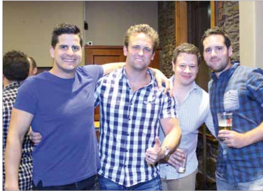
1994 20 Year Reunion - Saturday 11th October 2014, General Havelock Hotel